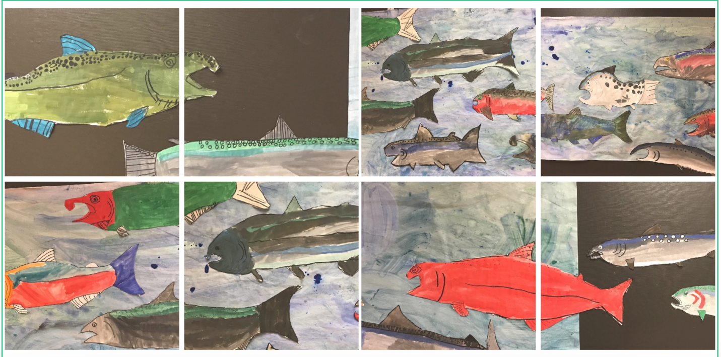
2/3/4 class Salmon paintings

There have been lots of things happening at Fort Rupert. Science experiments are underway in the K/1 classroom. Many of our smallest learners are on their way to becoming successful and confident readers. The 2/3/4s are raising salmon, learning all about their growth cycle, and have gone to the hatchery to extend their learning. The 4/5/6 class has been busy learning about the Canadian government, practicing FITT techniques, and exploring mindfulness through art. The 6/7 class has been learning about Ancient civilizations, practicing French, and strengthening their basic math skills. It is pretty amazing all the learning that is taking place under our roof. Together we also continue to work on social emotional learning strategies.