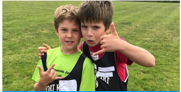
TRACK EVENT AT PHSS