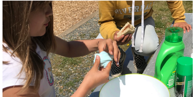
MAKING SLIME... OUTSIDE