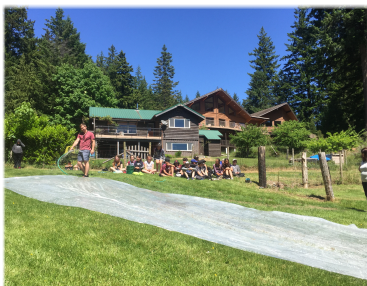
GIANT SLIP & SLIDE