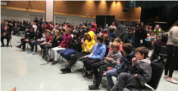
ALA'XWA TOURNAMENT AT THE CIVIC CENTRE