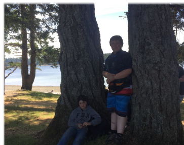
REBECCA SPIT MARINE PARK